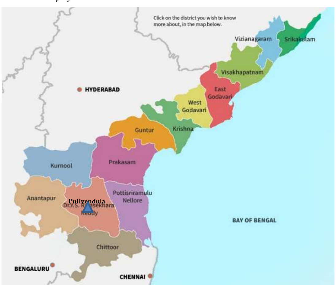
Fig 1: Location of Pulivendula Town